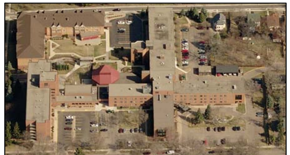
Assisted Living Center at Lyngblomsten St. Paul, MN