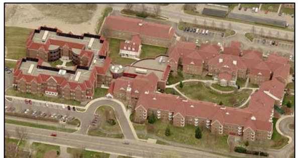
Presbyterian Homes Bloomington, MN