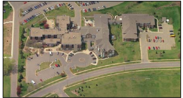
Ebenezer Senior Housing Burnsville, MN